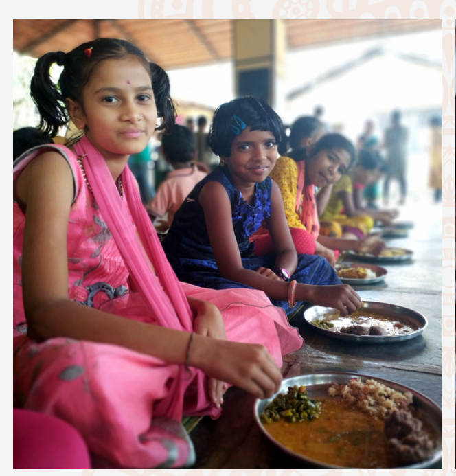
Anna = Food - Daan = Charity Annadaan is a Charitable Donation for Food

Indian tradition and philosophy dictate that the actions of offering knowledge (education) to the less fortunate or feeding the needy are considered to be amongst the most pious of acts that one can undertake during one's lifetime. It is considered the duty of every able person to partake in such actions to help uplift the underprivileged.